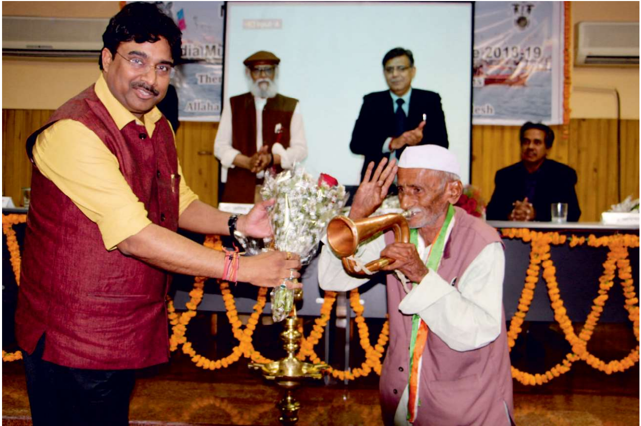
Honour to a Freedom Fighter