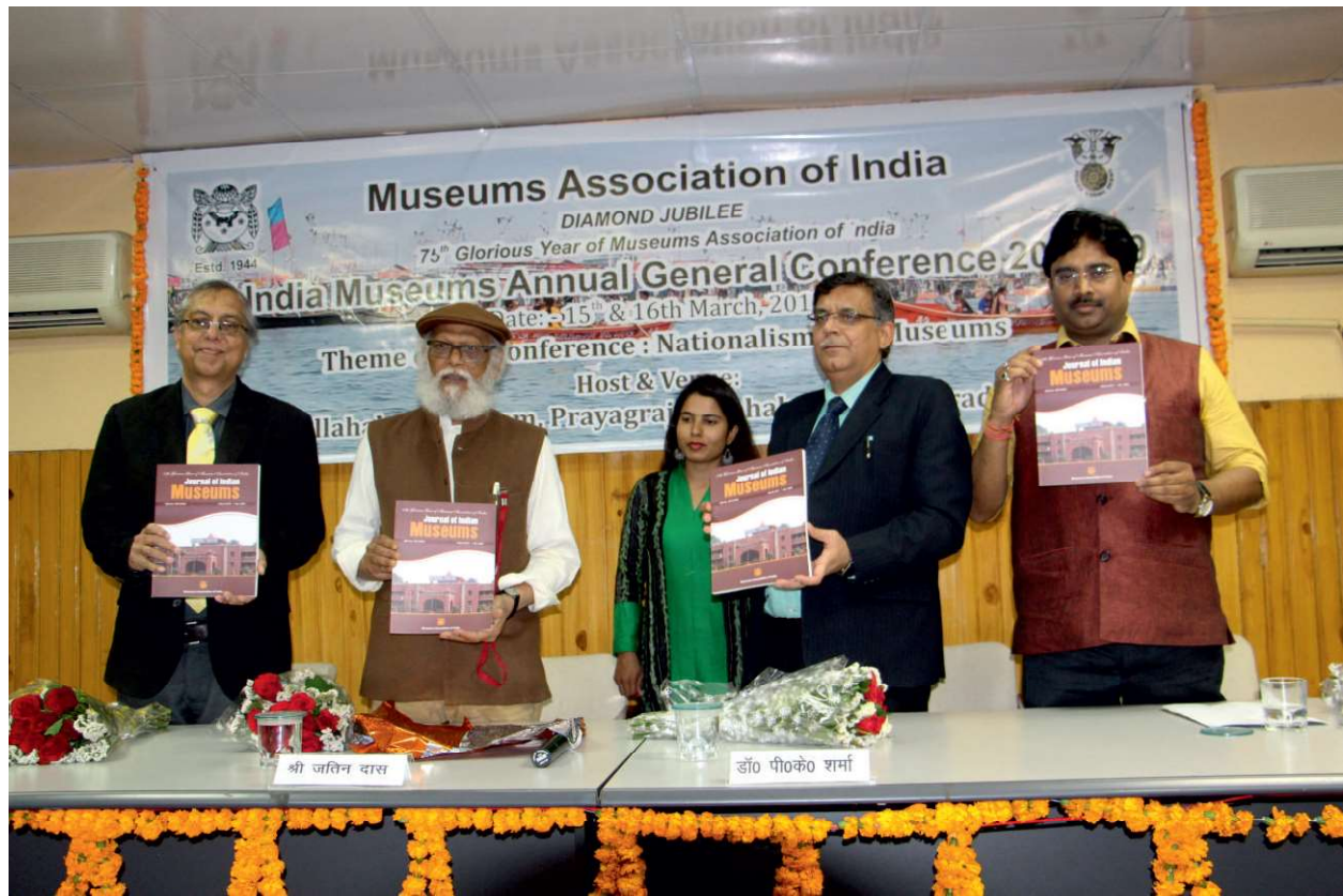
Release of Journal of Indian Museum